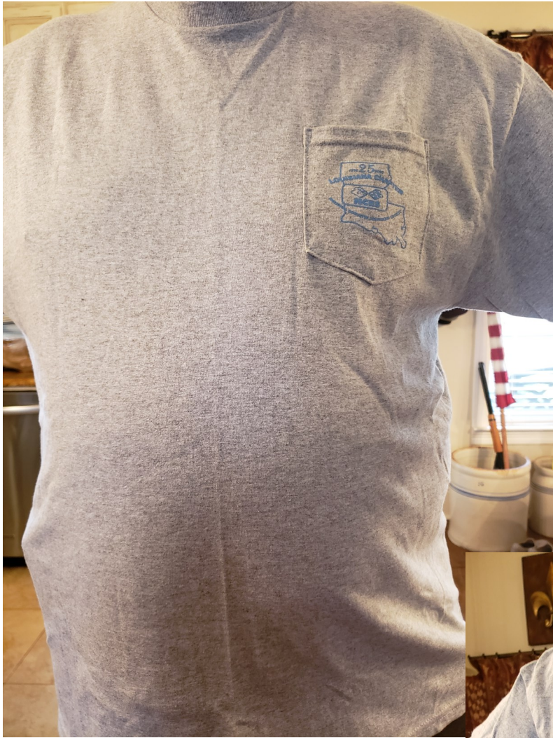
25th Anniversary Shirt - Front View