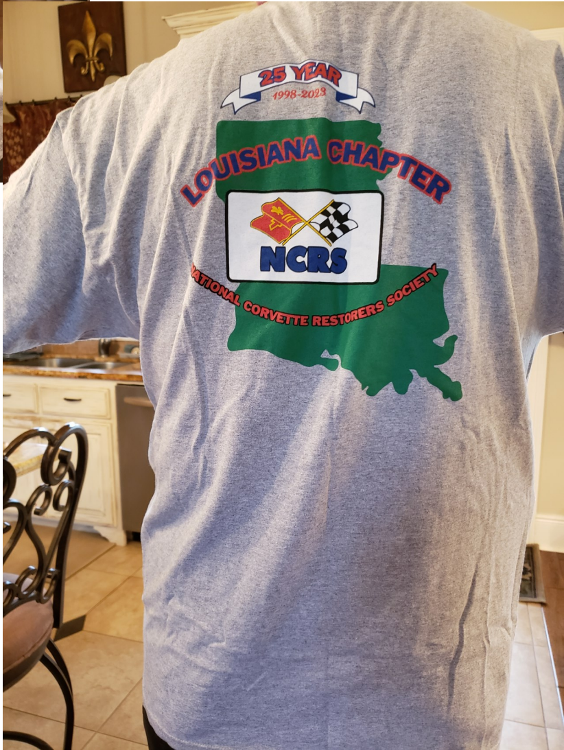
25th Anniversary Shirt - Back View